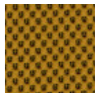
Network fabric 9 Colors